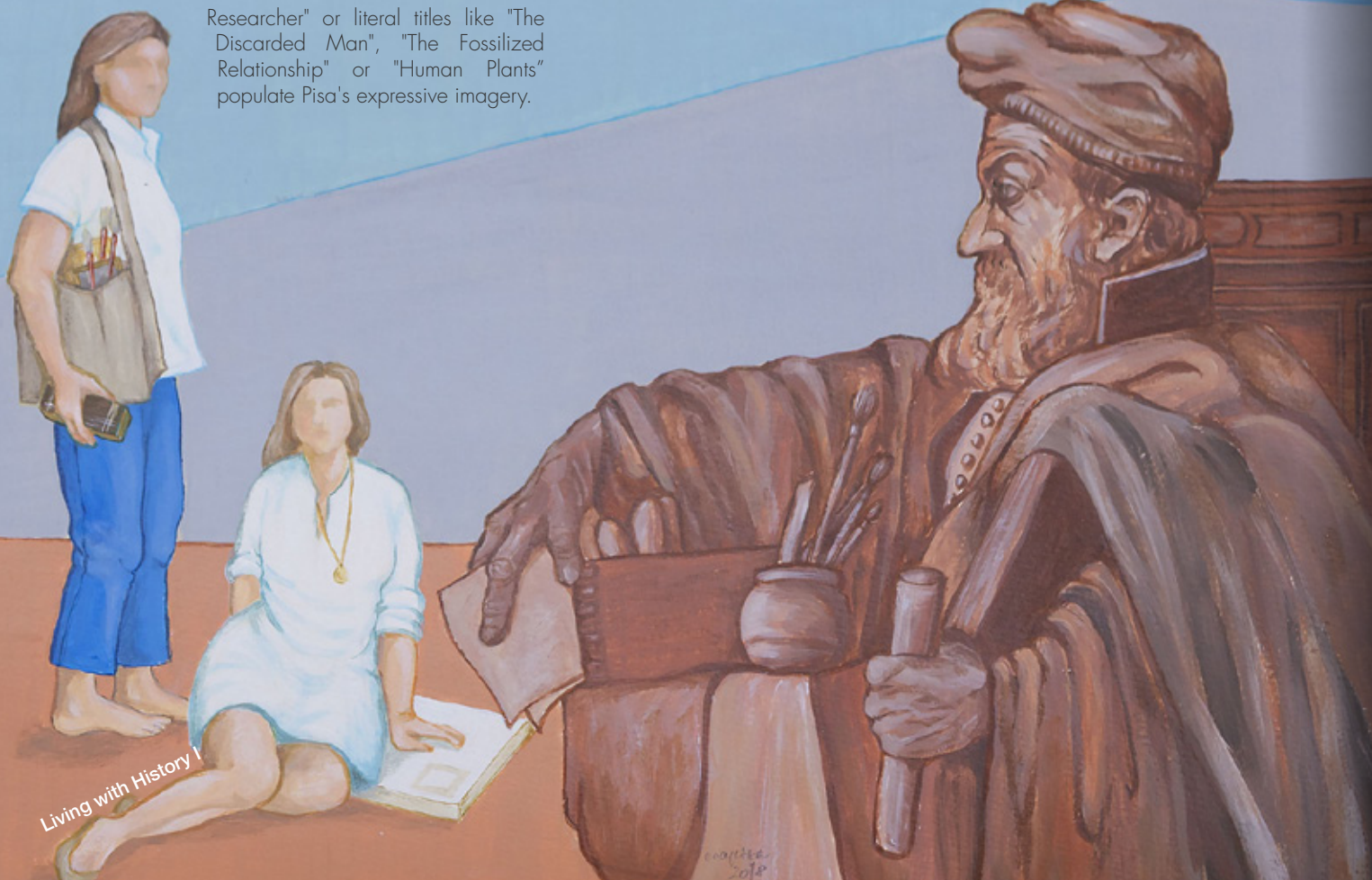
Living with History I