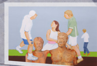
Living with History II